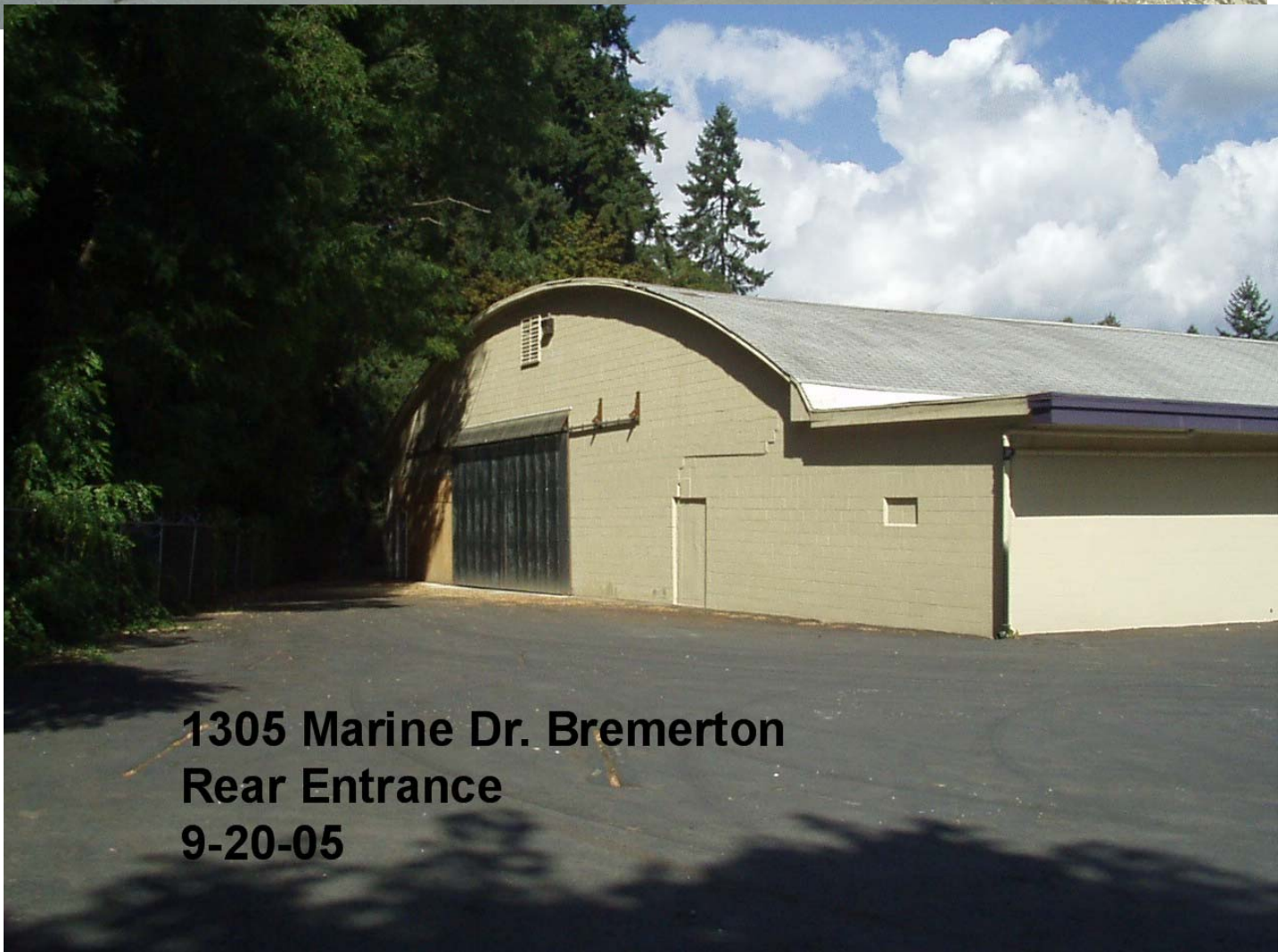
1305 Marine Dr. Bremerton Rear Entrance 9-20-05